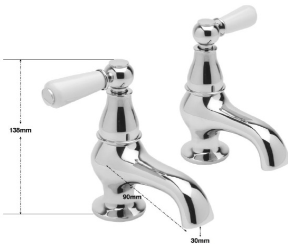
Max Flow Cold Tap